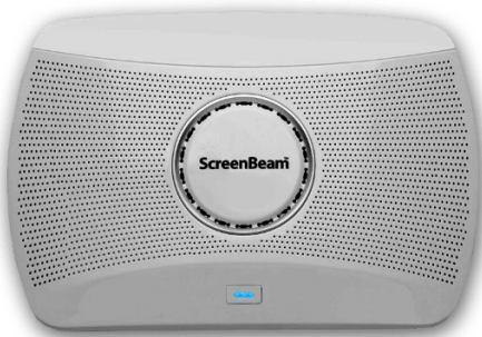
ScreenBeam 1000 EDU SBWD1000EDU