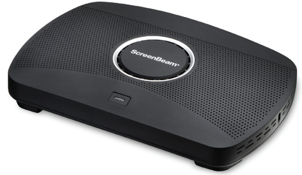
CATALOG NUMBER SBWD1100P ScreenBeam 1100 Plus Wireless Display Receiver with ScreenBeam CMS

Presenter and guest devices have multiple ways to connect including Miracast™, local Wi-Fi mode, and network infrastructure connectivity. New HDMI input reduces conference room complexity and costs by eliminating unnecessary equipment while making it easy for older devices without wireless display capability to connect and display. Windows and macOS users can share content in both duplicate and extended screen modes and Multi-View allows up to four client devices to share content on-screen simultaneously.